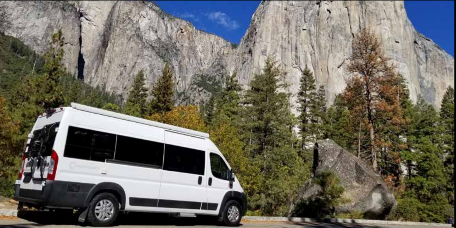
RAM Promaster 3500, Pentastar 3.6 L, 280HP