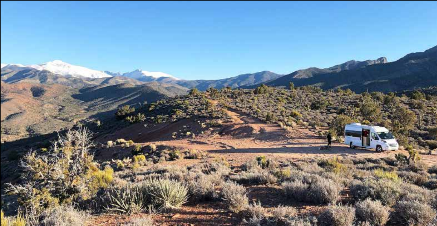
RAM Promaster 3500, Pentastar 3.6 L, 280HP