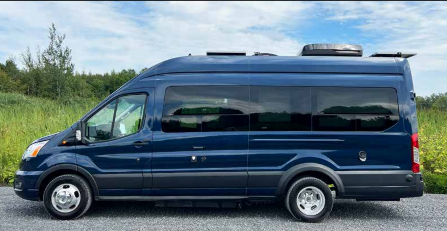
Ford Transit AWD 350 HD with Eco-Boost engine and all-wheel drive