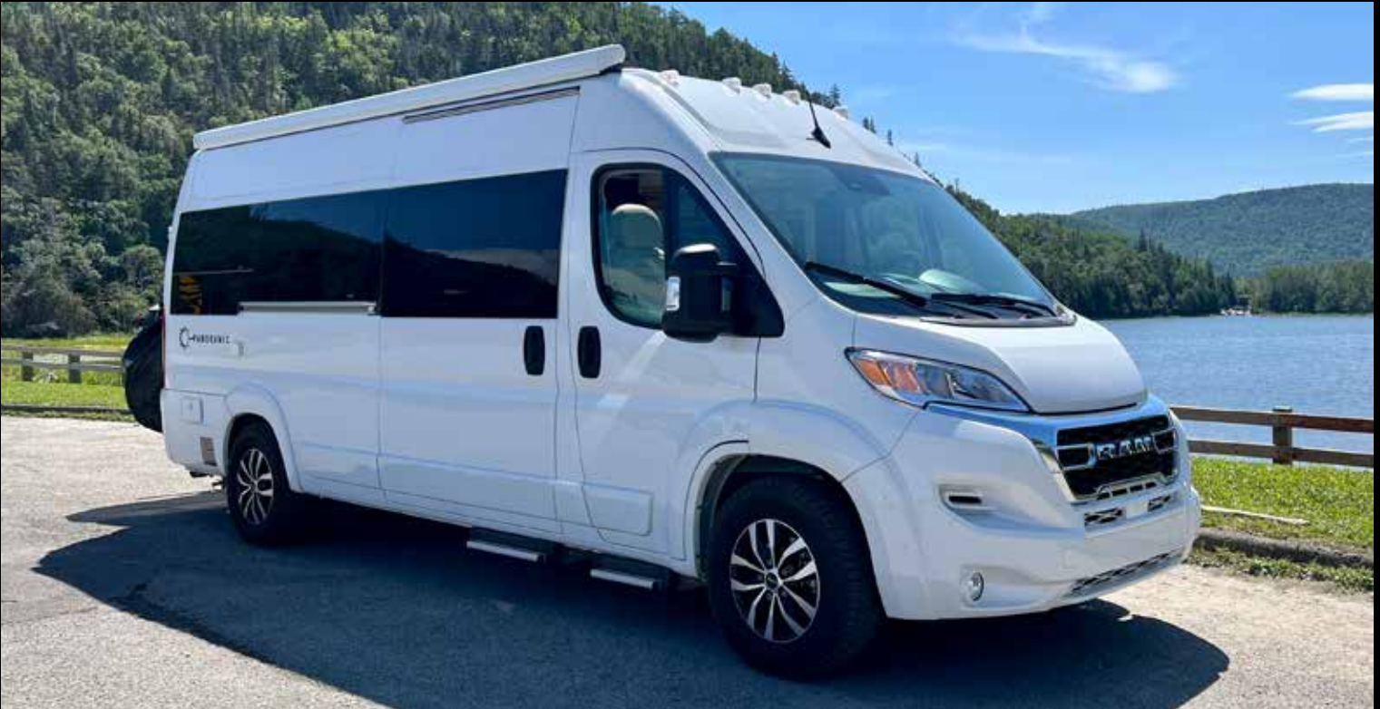
RAM Promaster 3500, Pentastar 3.6 L, 280HP